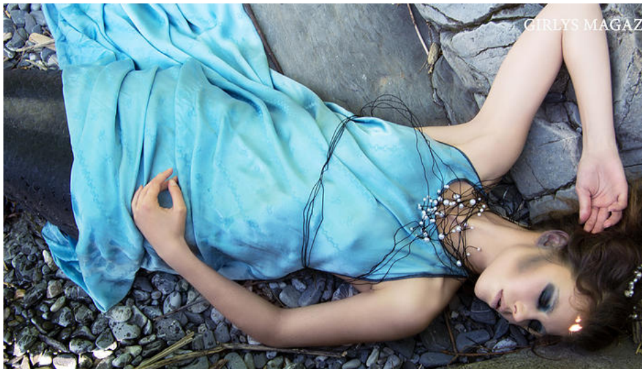
Maxi silk dress, MADEMOISELLE L. Body jewel, Pearls head clips, CREA-TIFF BIJOUX