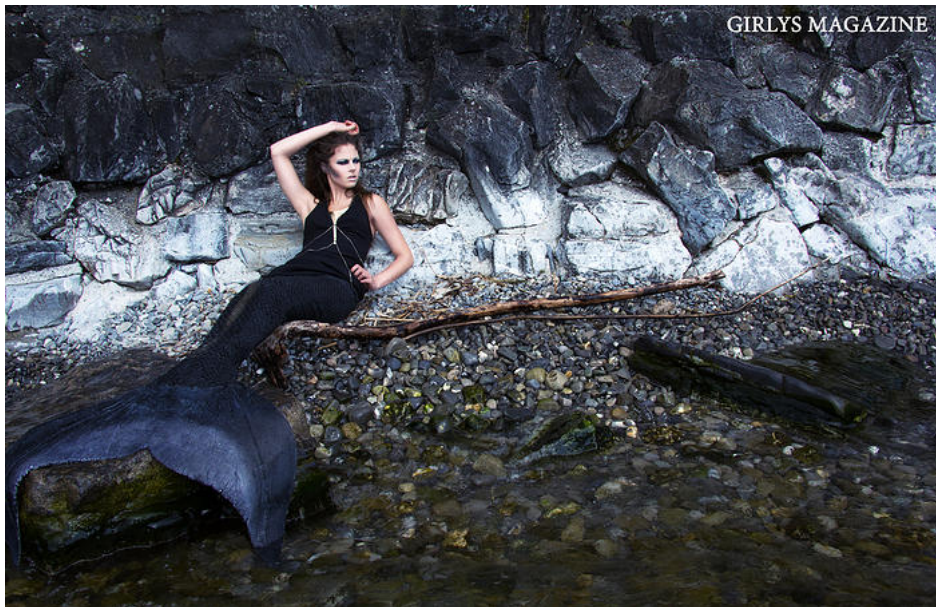
Backless maxi chiffon dress, VINTAGE. Body jewel, Nose ring, BAIES D'ERELLE