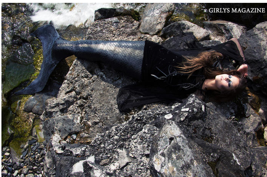
Mesh and velvet dress, H&M. Necklaces, CREA-TIFF BIJOUX