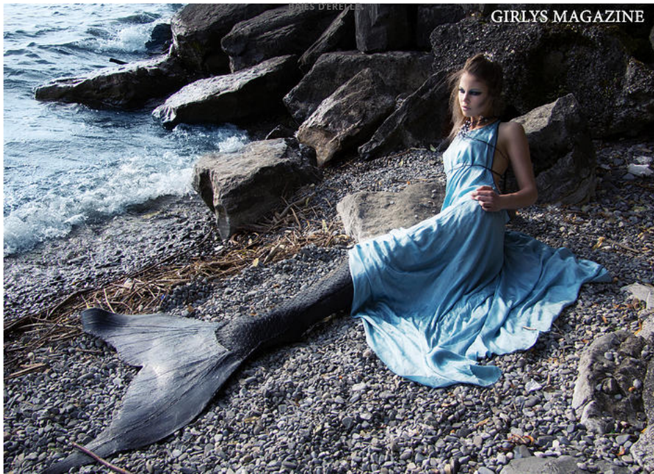
Maxi silk dress, MADMOISELLE L. Body jewel, Pearls head clips, CREA-TIFF BIJOUX