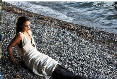
Maxi silk cream dress, MADEMOISELLE L. Stone Necklace, Arm jewel,